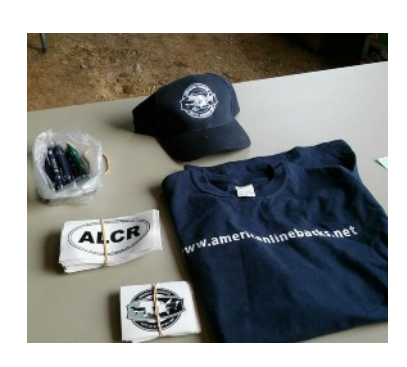
Above (L-R): Back of T-shirt & Front of T-shirt with other promotion items.