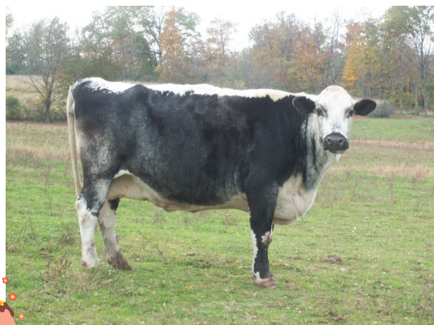
“Surprise”, picture taken while dry