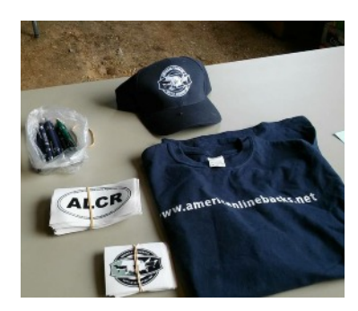
Above (L-R): Back of T-shirt & Front of T-shirt with other promotion items.