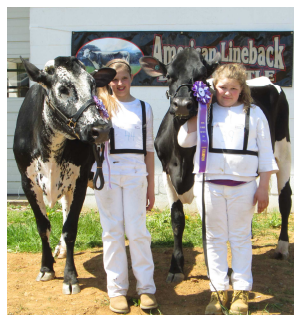
Res Grand and Grand