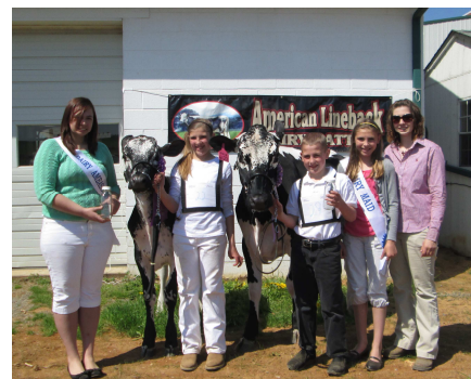
Jr Champion and Res Jr Champion