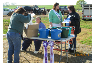
The people keeping everything in order!