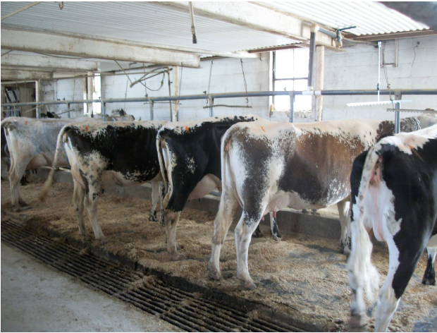
Some of the milk cows

In the 54 head sold at the sale, there was a total of five bulls consigned, the rest were cows, calves and heifers. The females averaged, $985 and Bulls averaged $785