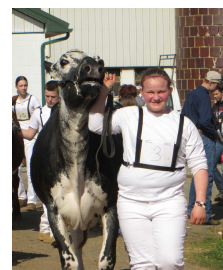
All smiles coming out of the show ring