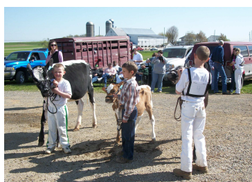
Our "Pee Wee Show"!