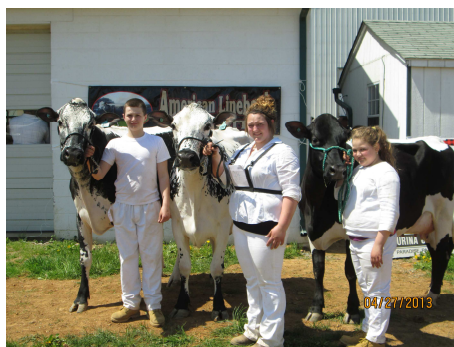
"Best Three" Winners