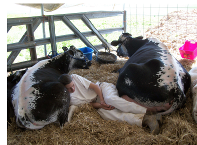
"Nap Time" after the show!!