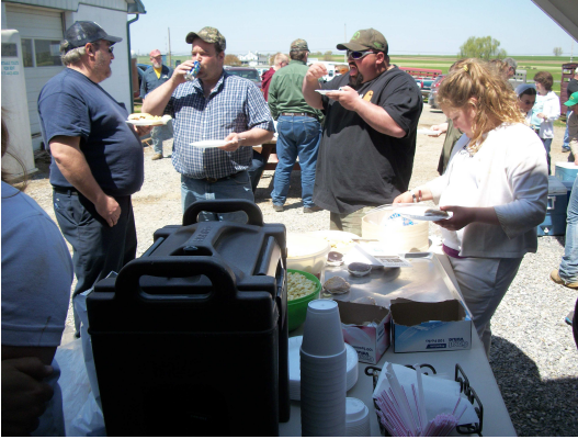
Many people enjoyed our lunch!

On Saturday, April 27th, The 21st Annual Lineback Sale was held at Fisher's Quality Dairy Sales, in conjunction with the National Jr. Show! Both the show and sale had great turn outs!!!