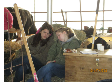
Not everybody was ready to wake up