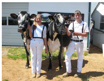
Winners of "Best Bred and Owned"