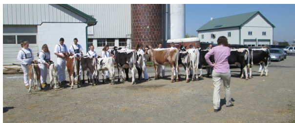
Picking of Jr. and Res. Jr Champion